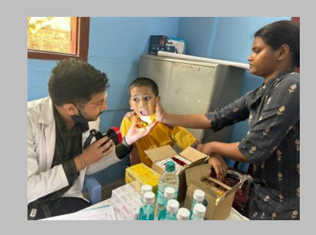
Highlight 4: World Health Day Celebration